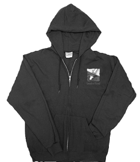
Convention Logo Hoodie (See order form above)